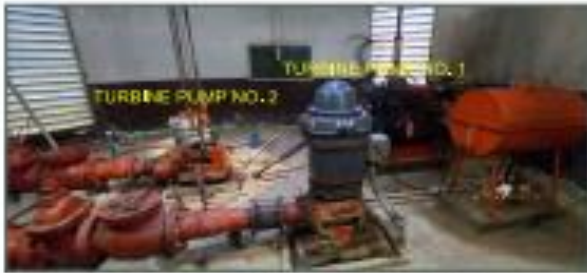
COLLECTOR WELL PUMPING STATION W/ VERTICAL TURBINE PUMP NO. 1 AND 2