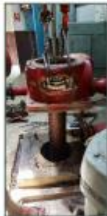
DISCHARGE HEAD ASSEMBLY