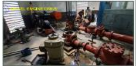
DIESEL ENGINE DRIVE