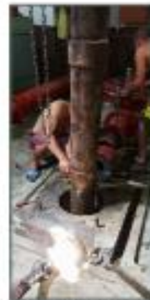
COLUMN SHAFT ASSEMBLY COUPLING