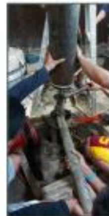
STAINLESS STEEL SHAFT COUPLING