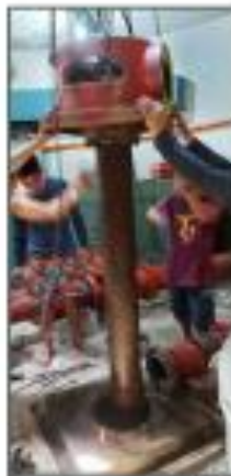
COLUMN AND LINE SHAFT ASSEMBLY