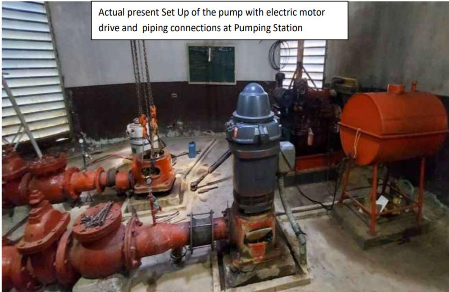
Actual present Set Up of the pump with electric motor drive and piping connections at Pumping Station