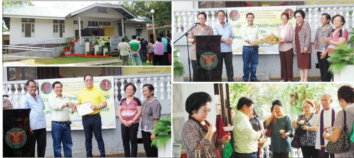
Various scenes during the Inauguration and Blessing of the UPHSI Learning Resource Center.

THE UP High School in Iloilo (UPHSI) of UP Visayas now has a Learning Resource Center (LRC) for the students through the generosity of its alumni.