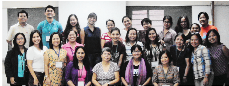
The participants from various UP System Women/GAD offices.

FOR more than two decades, the various women/gender centers/offices and programs in the UP System have been implementing gender-specific activities and courses that each UP unit has developed as a response to each of the constituent's needs within the cultural context of its region. As they gained a rich experience in organizing and facilitating these trainings, there is a need to review the current programs and agree on important key elements and strategies in mainstreaming gender in the University. As a response to this felt need, the University Center for Women Studies, under the leadership of Prof. Judy Taguiwalo and in partnership with the UPV Gender