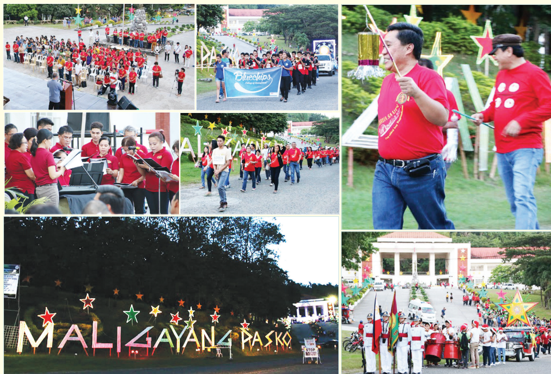
Various scenes during the Paskua 2014 celebration.