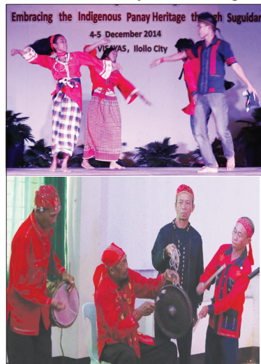
The Panay Bukidnons are known for their Binanog Dance and Panubok.

For years now, UP Visayas has been advocating for the promotion and preservation of these epics in Region VI. In the