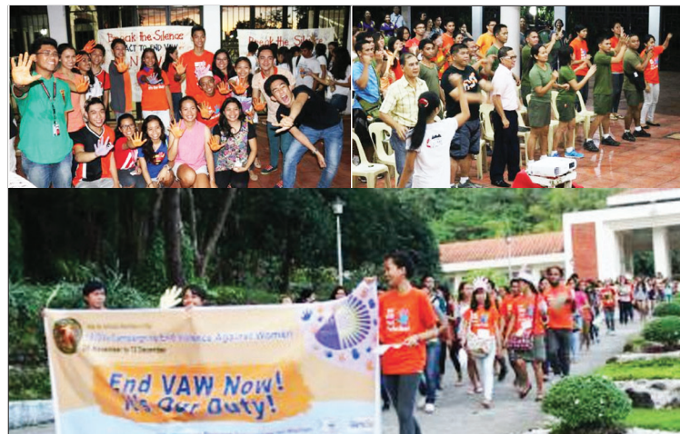
EVAW advocates gathered for a walk to end Violence Against Women.