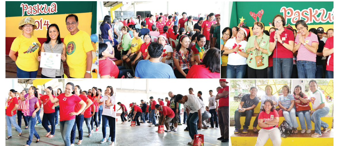
UPV employees enjoy a great time during the team building activity held at the Covered Court, Miagao campus.