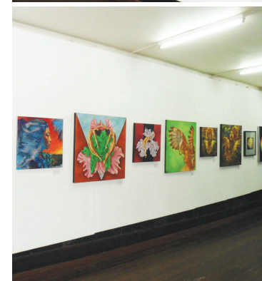
Artworks of alumni and faculty members of the INHS School for the Arts exhibited at the UPV Art Gallery.

THE Iloilo National High School (INHS)- School for the Arts Visual Arts Alumni Association, in collaboration with the UPV Chancellor’s Committee on Culture and the Arts (UPV-CCCA), opened a Visual Art exhibit at the UPV Art Gallery, UPV Iloilo City campus, on November 7, 2014.