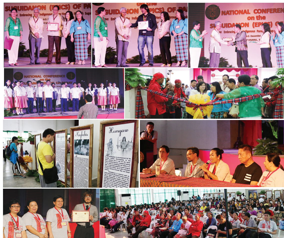
Various scenes at the National Conference on the Sugidanon (Epics) of Panay.