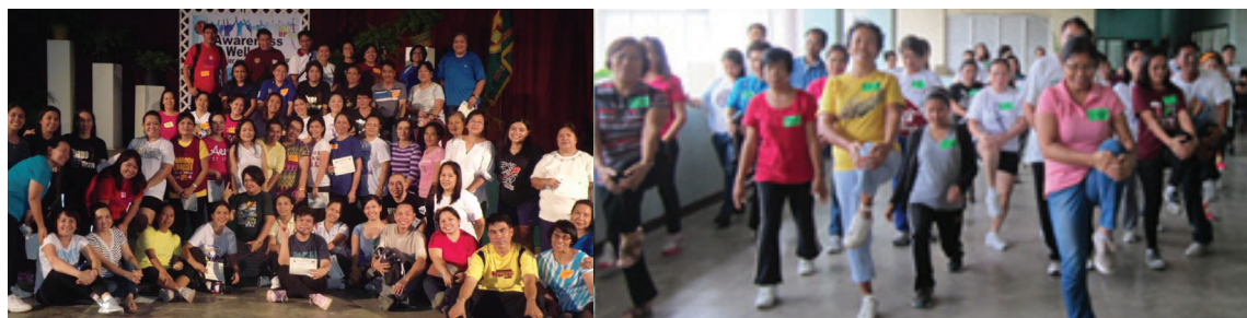
(L-R) 1) The participants pose for a group picture after the seminar. 2) The participants in action.

THE Department of Physical Education (DPE), College of Arts and Sciences, teamed up with the UPV Healthy Lifestyle and Wellness Program Committee in organizing a seminar-workshop entitled, "Awareness to Wellness: For a Healthier and Progressive UPV."