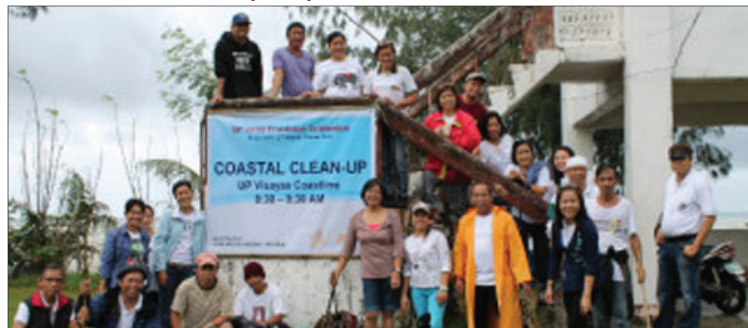
CFOS faculty and staff collected 20 bags of trash along the 1-km Miagao beachfront area of the CFOS Wet and Dry Laboratories.