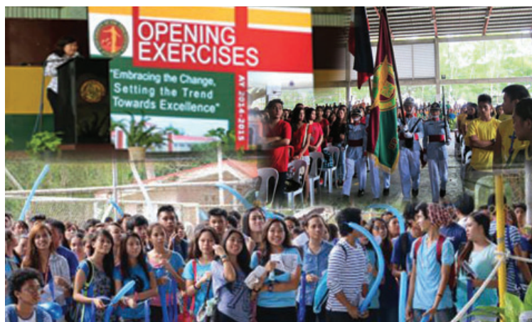
Various scenes during the opening exercises at the Miagao campus.

everyday life," she said. She added that in UP, it is expected that students are aware of the burning issues of the day, be it on the local, national and international arena.