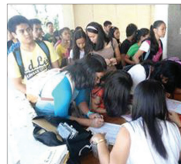
Students register for the 3-day AAP.

The first AAP this year was held at Taft National High School in Taft, Eastern Samar, where over 15 volunteers conducted five days of tutorials for incoming senior students of different high schools in neighboring municipalities.