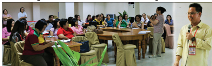
Capadosa (inset right) of CSC R-6 discusses the Anti-Red Tape Act of 2007 to UPV frontline service providers (left).

The seminar was in line with compliance with the RA 9485 or the Anti-Red Tape Act of 2007 which is "An act to improve efficiency in the delivery of government service to the public by reducing bureaucratic red