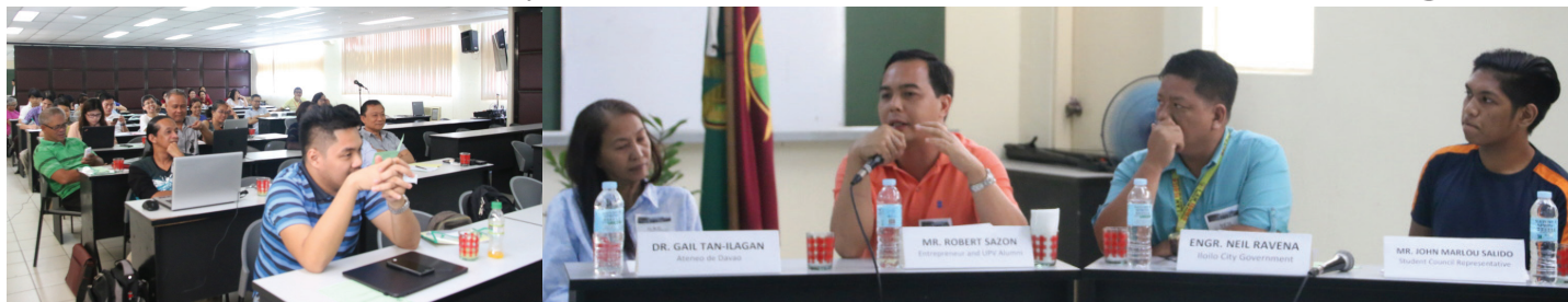
Resource persons answer questions from the audience

THE University of the Philippines Visayas conducted a Workshop-Forum on Quality Assurance (QA) for UPV Academic Programs on May 29-30, 2017 at the GCEB Training Rooms, UP Visayas, Iloilo City campus.