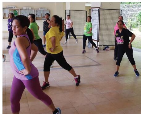
Miagao employees look forward to the weekly Zumba.