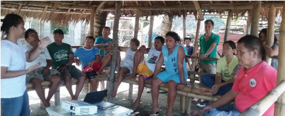
Damilisan fisherfolks listen to UPV experts

THE Institute of Fisheries Policy and Development Studies (IFPDS) conducted an information, education, and communication (IEC) campaign for the sustainable management and operation of the newly established marine protected area (MPA) on May 5 and May 13, 2017 at Brgy. Damilisan, Miagao, Iloilo.