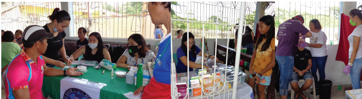
Residents of Brgy. Lumangan benefit from the UPV HSU medical mission

In the medical consultation conducted, there were 87 patients, 57 of whom were adults and 30 children. There were 30 patients for the dental service and 31 for the circumcision. The REAL Medical Laboratory and