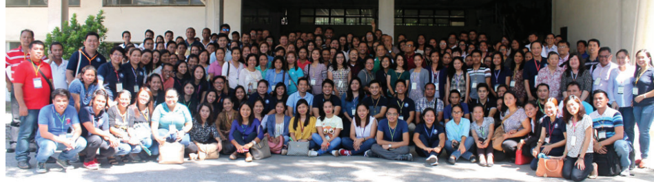
The first gathering of fisheries professionals draws a crowd of participants.