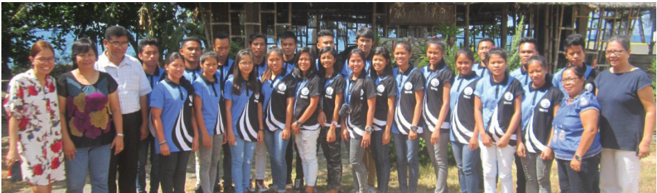
UA and NIPSC students together with the Institute of Aquaculture staff

TWENTY-THREE (23) incoming 4th year B.S. Fisheries students from the University of Antique (UA) and eleven (11) from the Northern Iloilo Polytechnic State College (NIPSC) attended the On-the-Job Training Program of the Institute of Aquaculture, College of Fisheries and Ocean Sciences from April 17 to June 02, 2017. As a continuing program, this was the third time for UA students to undergo the OJT while it is the first time for NIPSC students. The training program is granted upon