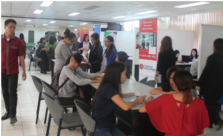
The Career Fair 2017 gives future graduates possible employment opportunities

UP Visayas, in partnership with the Public Employment Service Office (PESO) of the Province of Iloilo, conducted the UPV Career Fair 2017 on May 10 and 11, 2017 at the GCEB Training Rooms, Iloilo City.