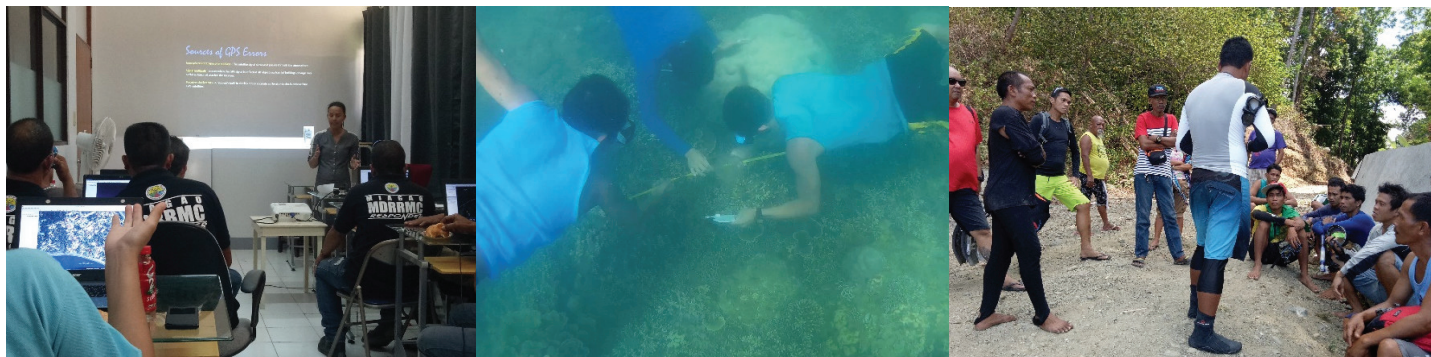
Various photos during the training

THE Institute of Marine Fisheries and Oceanology (IMFO) and the UP Fisheries Guild (UPFG) of the College of Fisheries and Ocean Sciences, UP Visayas, provided a series of trainings to assist in the management of the declared Marine Protected Areas (MPAs) in the Municipality of Miagao on May 2-5, 2017 on the UP Visayas Miagao campus.