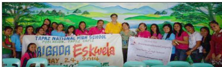
Representatives from UPV Library, Rotary Club of Iloilo West, and Philippine Army with the students and teachers of Tapaz National High School in Tapaz, Capiz.

Nine boxes of high school books were turned over to the Tapaz National High School while three boxes were donated to the Mawang Elementary