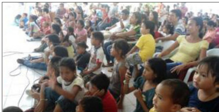
The children participants to the Children’s Summer Fair.

Pahalipay 2014 was made possible through the assistance of sponsors, which included Jollibee, Maybank, Nissan, Goldilocks, Toyota, Coca-Cola, Pagpaguitan Photography, and other donors who contributed in various ways.