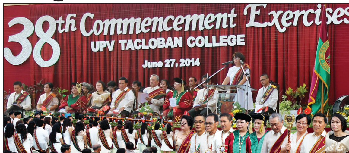
Various scenes from UPVTC's 38th Commencement Exercises.

JUNE 6, 2014 was a special day for every constituent of UP Visayas and the Municipality of Miagao. For the fourth time, the two institutions gathered to celebrate their friendship and cooperation through a fun run/walk, Mass, breakfast, boodle lunch, games and binayle (dance). This year, Miagao LGU was the host. The events, which started before sunrise and ended