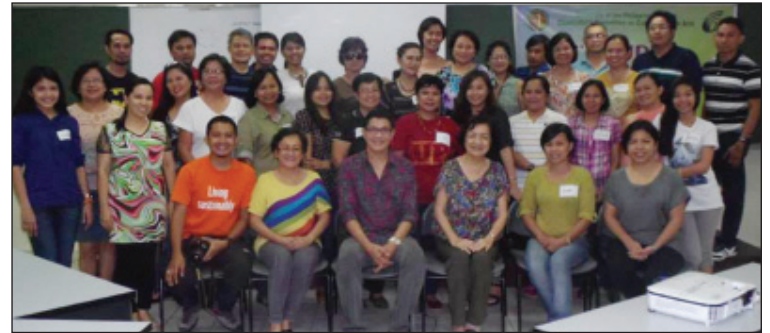
The workshop speakers and participants.

"An effective photo is a well-exposed and well-composed