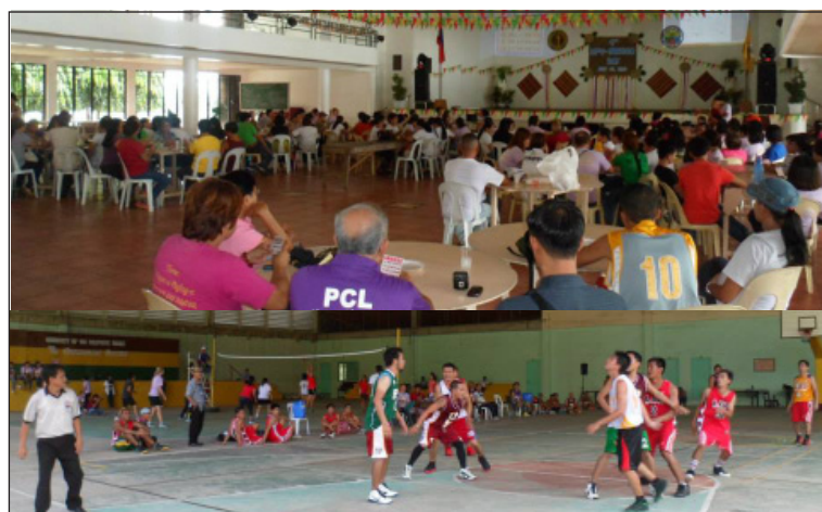
Employees of UPV and Miagao LGU enjoy the Bingo game (above) and the women volleyball and men basketball games (below).