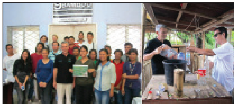
The participants pose with the resource speaker (left). The speaker demonstrates how to do the organic bamboo treatment (right).

extracts, making it 99% organic. It acts as a non-toxic and natural treatment for termites, pests, and more than 500 parasites in wood, bamboo, rattan, garden soil, and foundations of buildings and houses. A natural nano-extender was added so that the treatment solution would become stable over a long period of time (six years as of date and counting). It is ISO-certified but research and development are continuous for higher cost effectiveness, efficiency, efficacy and convenience, according to the resource speaker.