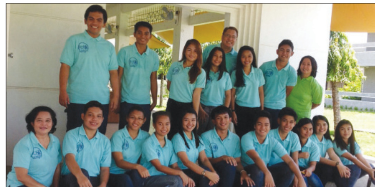
Members of the UPVTC Chorale.