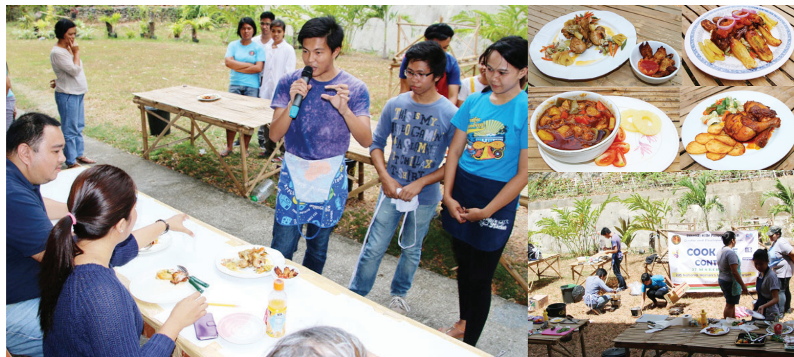
The cook-off contest among UPV students is one of the activities conducted by the GDP in celebration of the Women's Month.

A boodle lunch, also organized and sponsored by GDP, followed the cook-off that draw an estimated crowd of 200 students, faculty and staff. (Lyncen M. Fernandez)