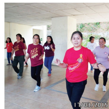
Employees at the Miagao campus join the Zumba session organized by UPV Gender and Development Program.

UPV employees, numbering about 30, enthusiastically joined a Zumba session in the afternoon of March 17, 2015 at the lobby of the New Administration Building, UPV Miagao campus.