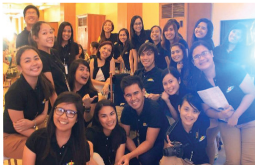
The fourth year BSBA Marketing students.

The event was organized by the AdCamp 2015 Committee composed of fourth year BSBA Marketing students from CM.