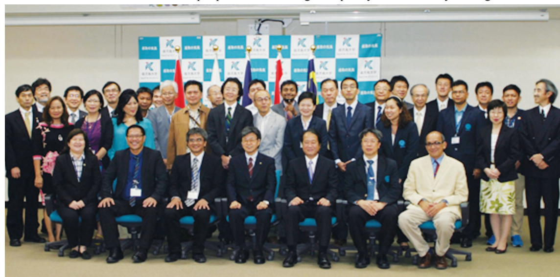
Members of the Governing Council and other delegates pose for a souvenir photo after the ceremonial signing of the Memorandum of Understanding for the Establishment of the Postgraduate Programme on Tropical Fisheries with International Linkage at Kagoshima University in Kagoshima City, Japan.