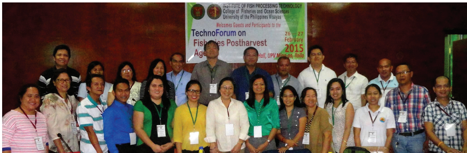
The participants of the two-day Techno Forum on Fisheries.