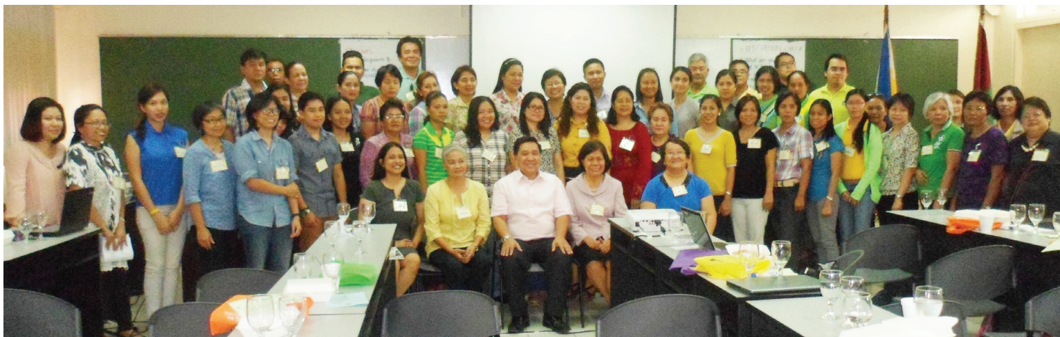
The participants and organizers of the SPICE forum pose for a souvenir photo with Chancellor Espinosa (seated, 3rd from left).