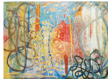
Moving On II: "Idleness is the devil's workshop." 2014, acrylic on canvass

reflection channeled by the artist into painting markers of both personal reflection and formal exploration. She also noted that the recent paintings consist mostly of loops winding through space and through themselves, clouds of pigment built through scattered brush strokes, and the