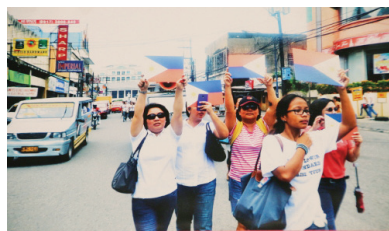
Out on the streets

The entry, "Write Your Way into the Future" which depicted