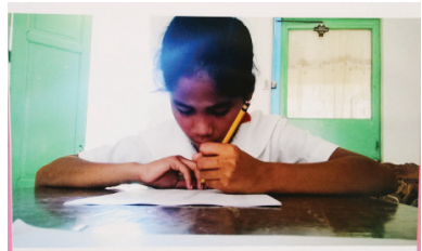
Write your way into the future