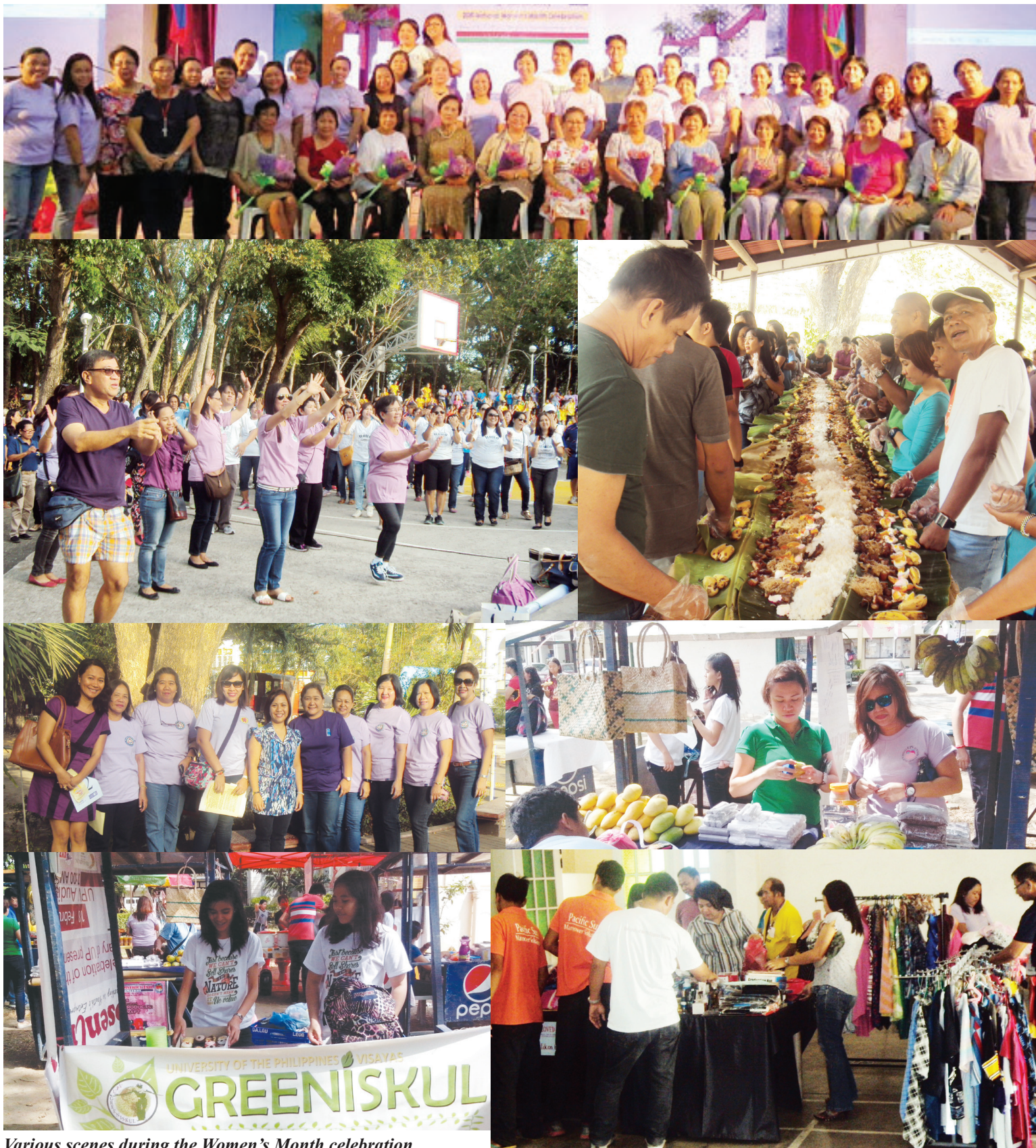
Various scenes during the Women's Month celebration.

With GDP as lead office, UP Visayas continues in its advocacy for gender development of women in Region 6. (Lyncen M. Fernandez)