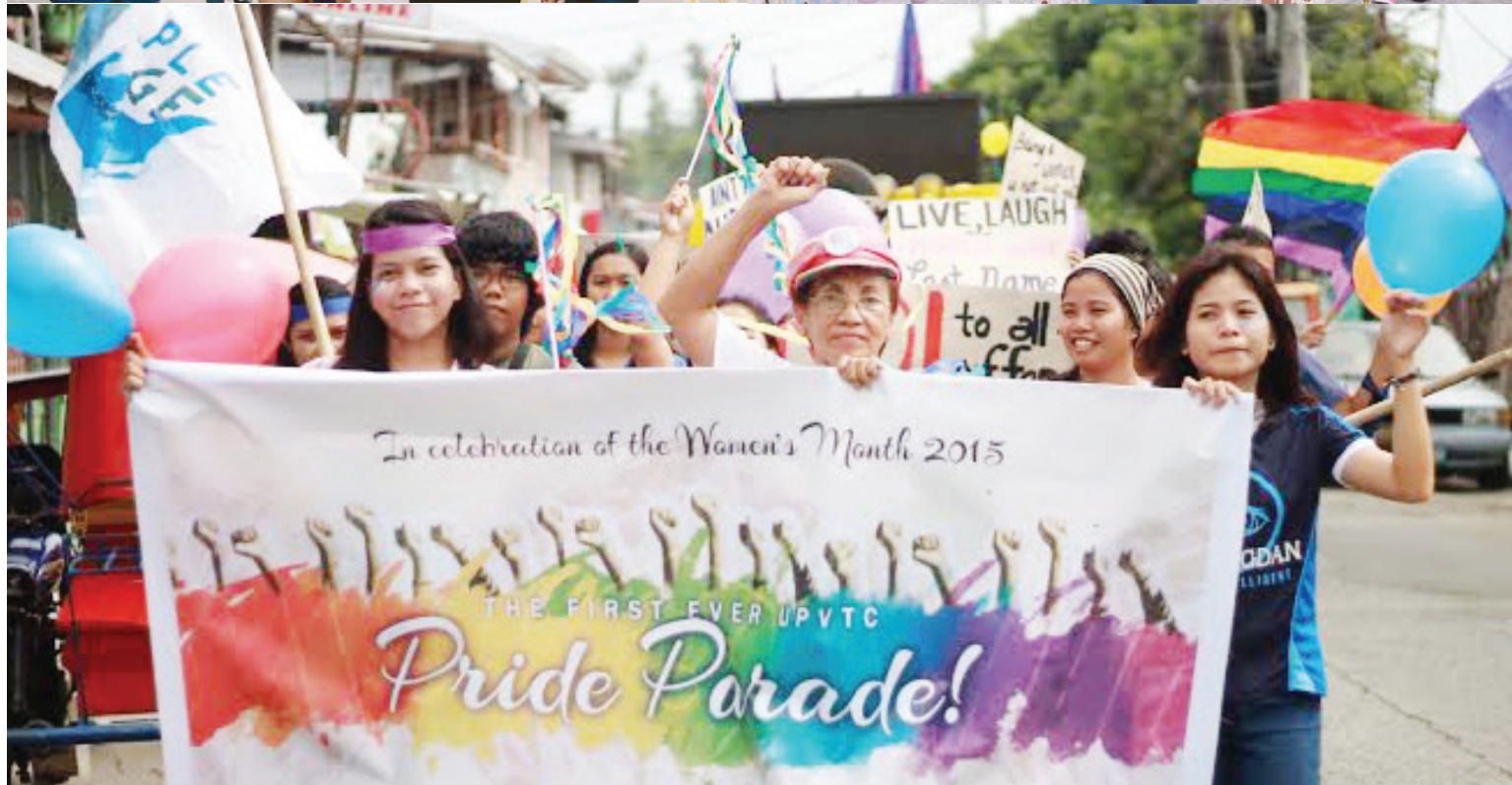
UPVTC organizes various activities in celebration of Women's Month.