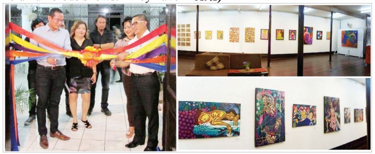
(L-R) Opening of the exhibit (at the UPV Art Gallery) of various artworks of visual artists from the cities of Iloilo and Bacolod on display.

"Spectrum" ran until February 28, 2015. (Lenilyn B. Gallos, with sources from UPV-CCCA)